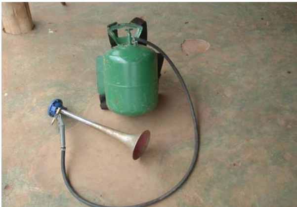
Air pressure horn used to deter elephants from crop fields.

Approx. cost for the first few pilot sound devices were Kshs 4,000 (USD 55), with the air release/handle as the most expensive part.