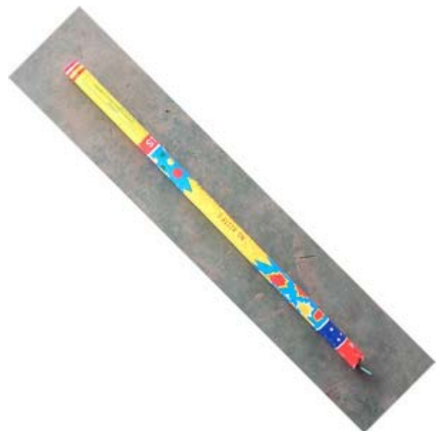
1.2. "Candle light" colored shots, ignited and directed towards elephants