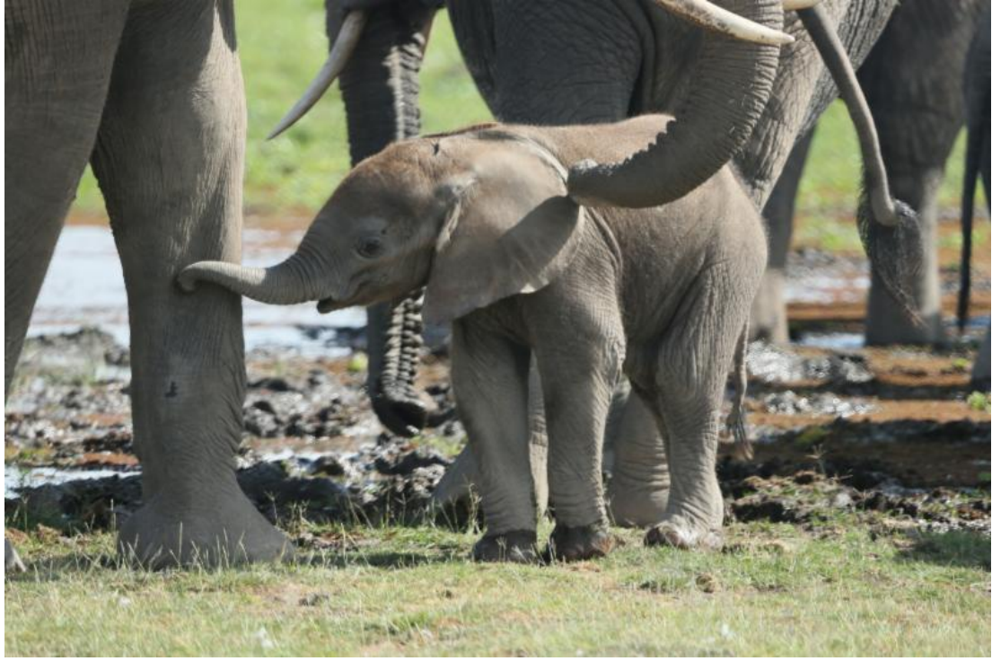
Fadila's new baby boy - FB Family