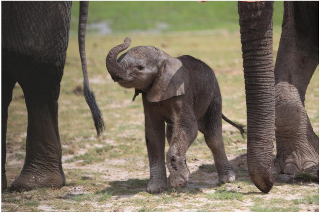
Ann's newborn female calf - AA Family