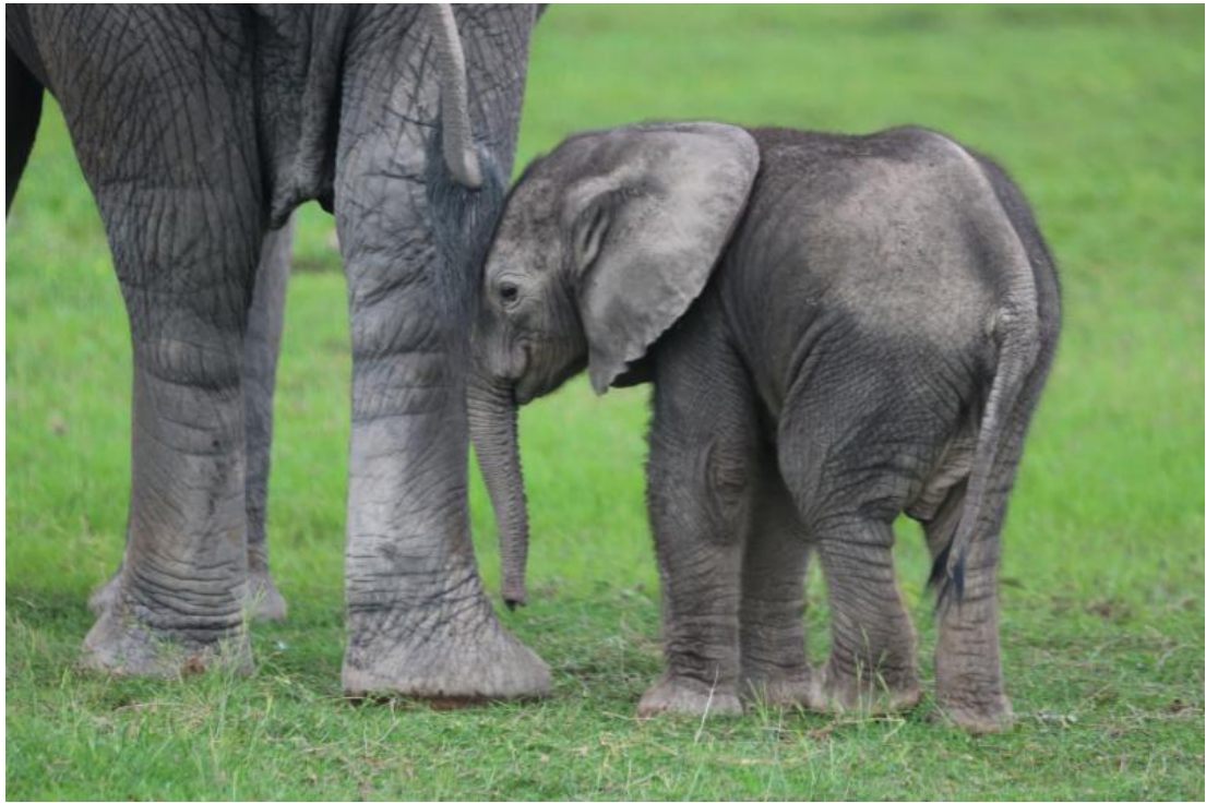
Europa's newborn son - EB Family