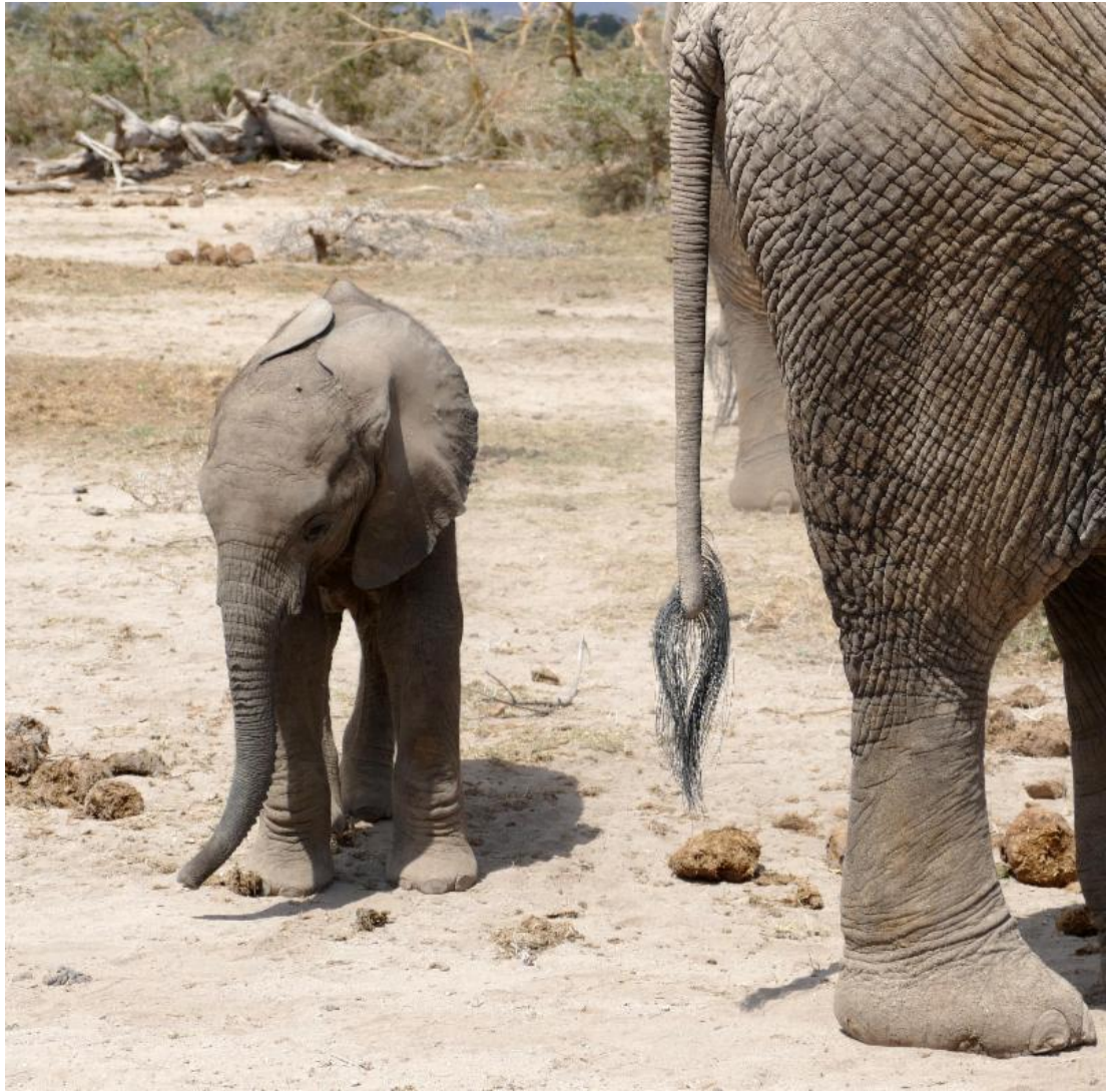
Enid's male calf - EB Family