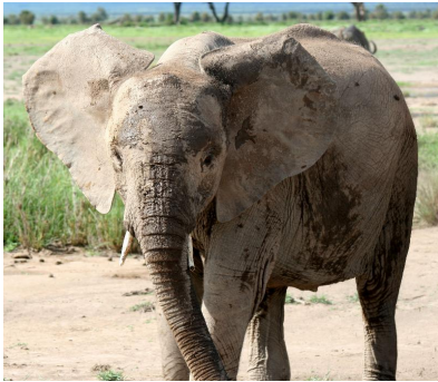
Typical 4-year-old calf ready to be named

A wonderful present for a loved one for these upcoming holidays is to name a calf in his or her honor. It's perfect for grandchildren, grandparents, favorite uncles, or even as a gift to yourself. Our naming program is exclusive. The name you choose will be assigned to a calf and entered in our database. That calf will never have another name. It's not like an adoption program where hundreds of people can adopt the same animal. You will receive photos of the calf and a history and present structure of its family. You can follow its life as it grows up. The usual donation to name a calf is $2500 but for the holidays we're offering a naming for $2000. For more information go to: www.elephanttrust.org/node/200 ; or write to us at info@elephanttrust.org .