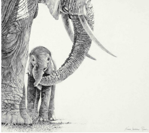
Flossie and Flash

Prints are $50, 12" square on professional grade textured art paper. Please note that in order to guarantee Christmas delivery within the U.S., we are now sending items by FedEx which will be an additional $20. For last minute orders contact ESwart@elephanttrust.org .