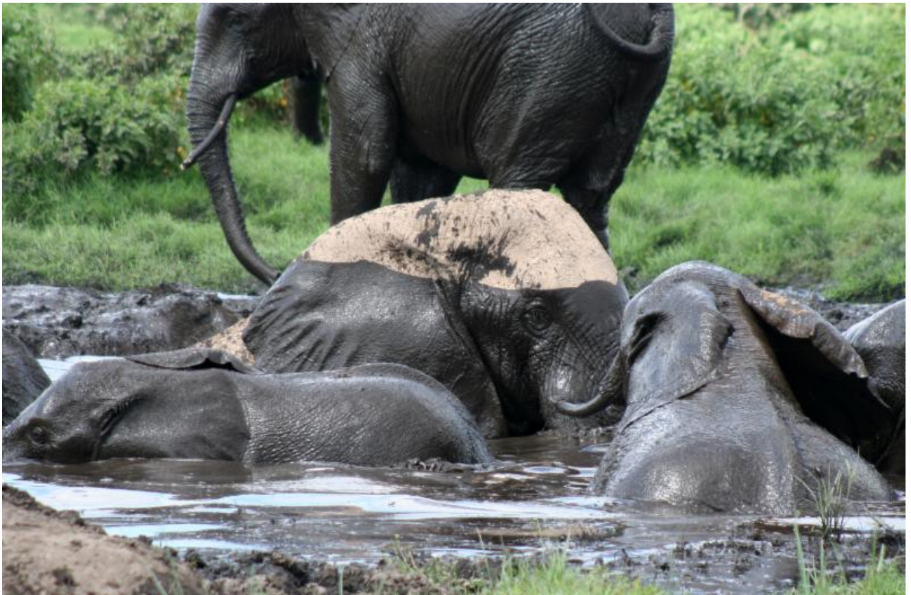
Enjoying the swamps