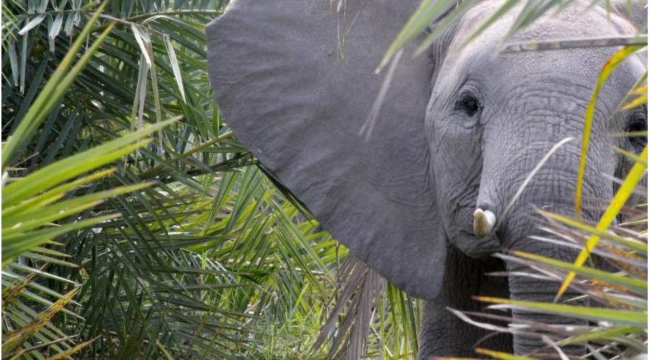
A youngster in the palm woodlands