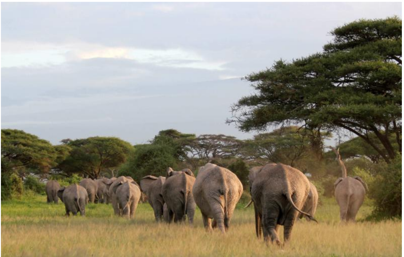
Moving out of the Park in the evening into the Acacia tortilis woodlands

We wish all our friends and supporters happy holidays and a new year filled with hope, peace and new beginnings.