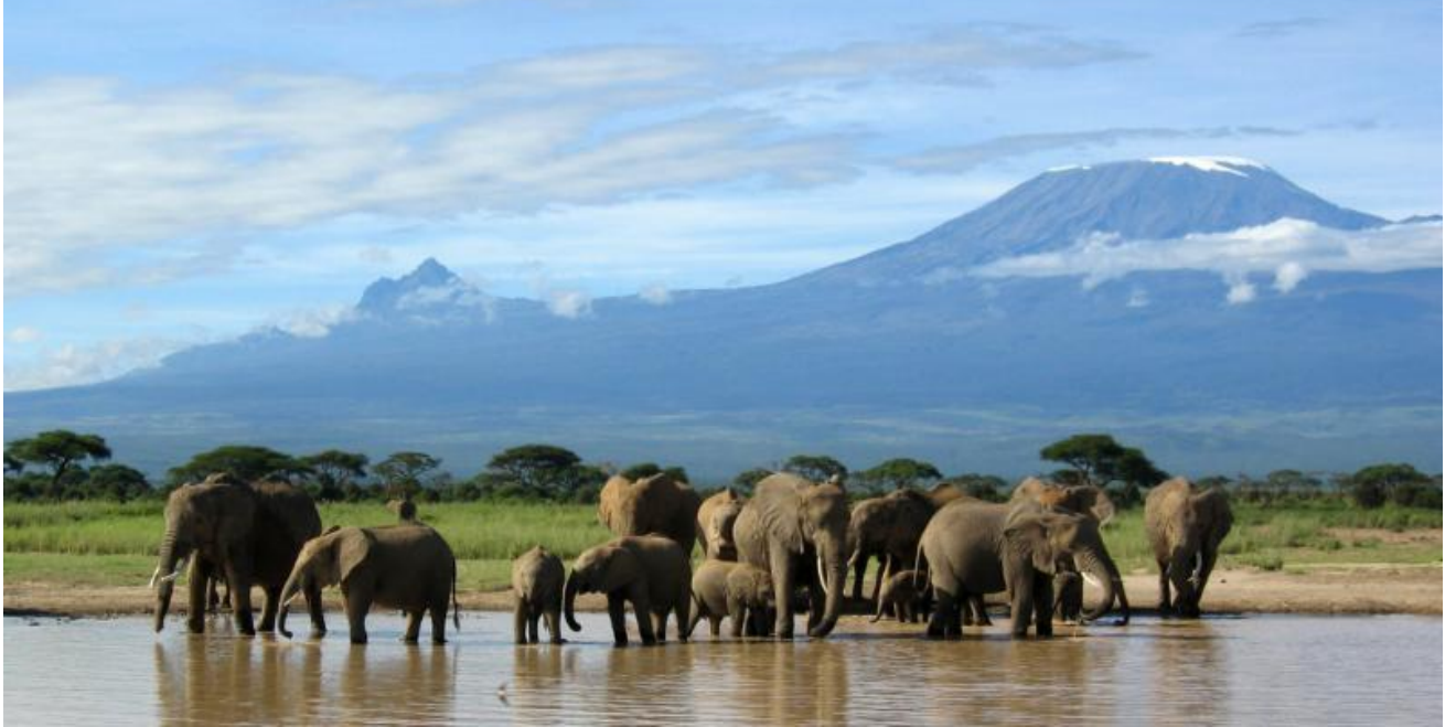
In the centre of the Park with spectacular Kilimanjaro as a backdrop